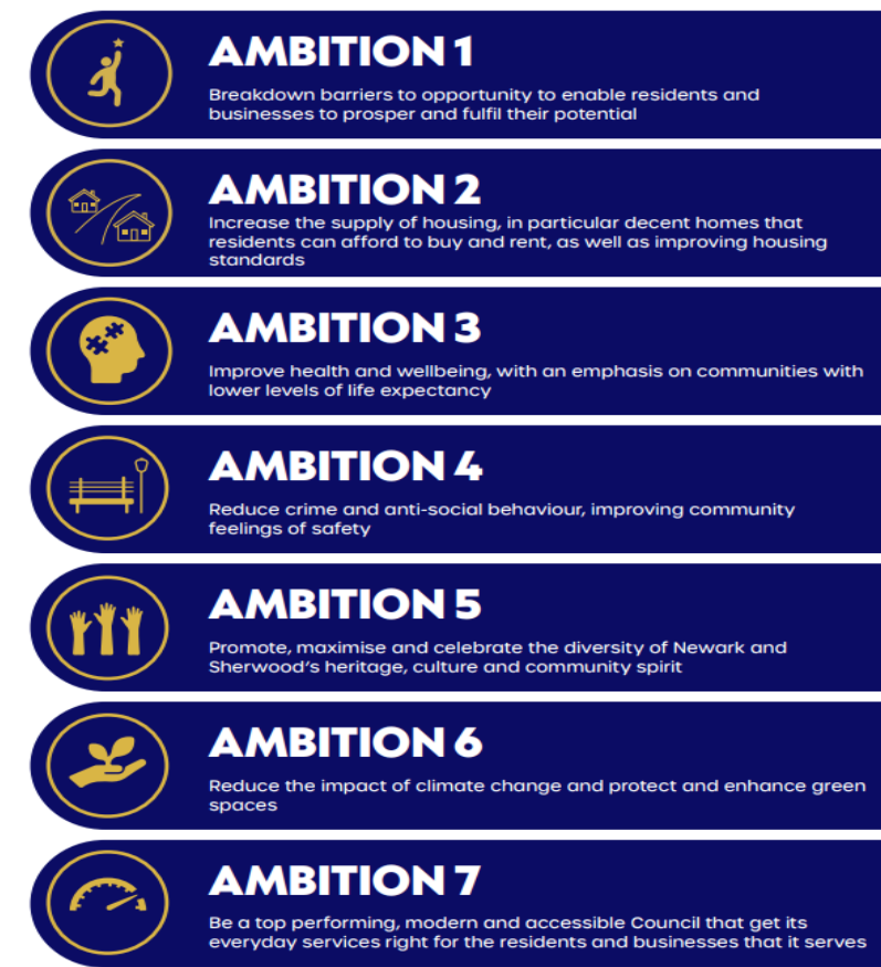
Figure 1. Community Plan Ambitions